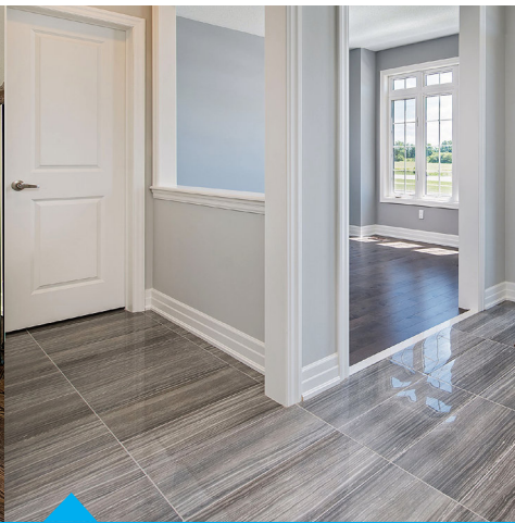
12" x 24" Floor Tiles