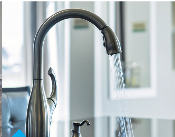
Pullout Designer Kitchen Faucet